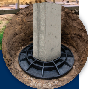
FootingPad shown with Perma-Column® post

FootingPad® footings are engineered using a fiber-reinforced composite that is exceptionally strong, lightweight, and superior to concrete.