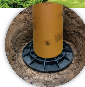
FootingPad shown with concrete tube form

*maximum load based on the psf soil capacity noted